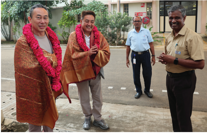
Customers from Japan visiting our Spinning Unit at Perumalpatti.