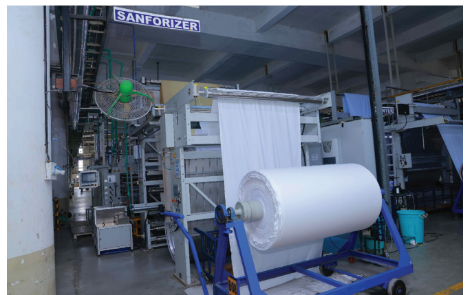
A view of new Sanforizer machine installed at our Fabric Division.